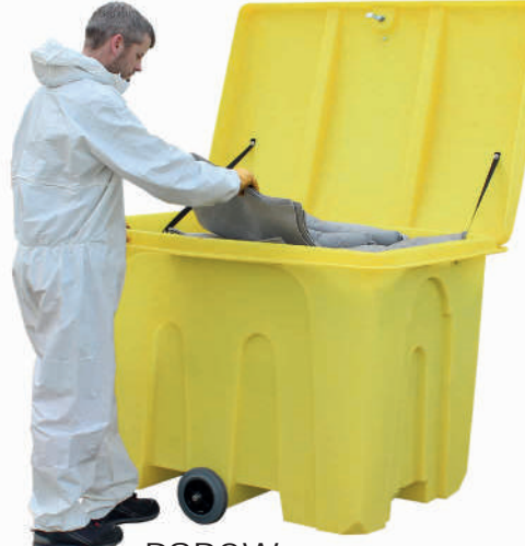
*Contents not included