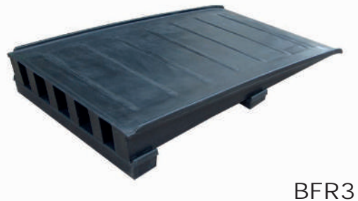
BFR3 is for use with BP4L