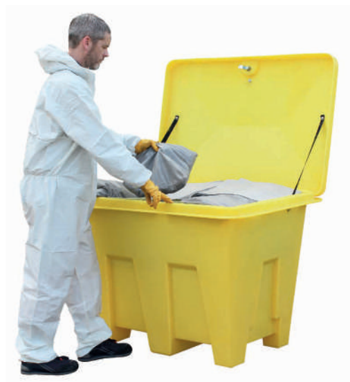
PSB2 *Contents not included